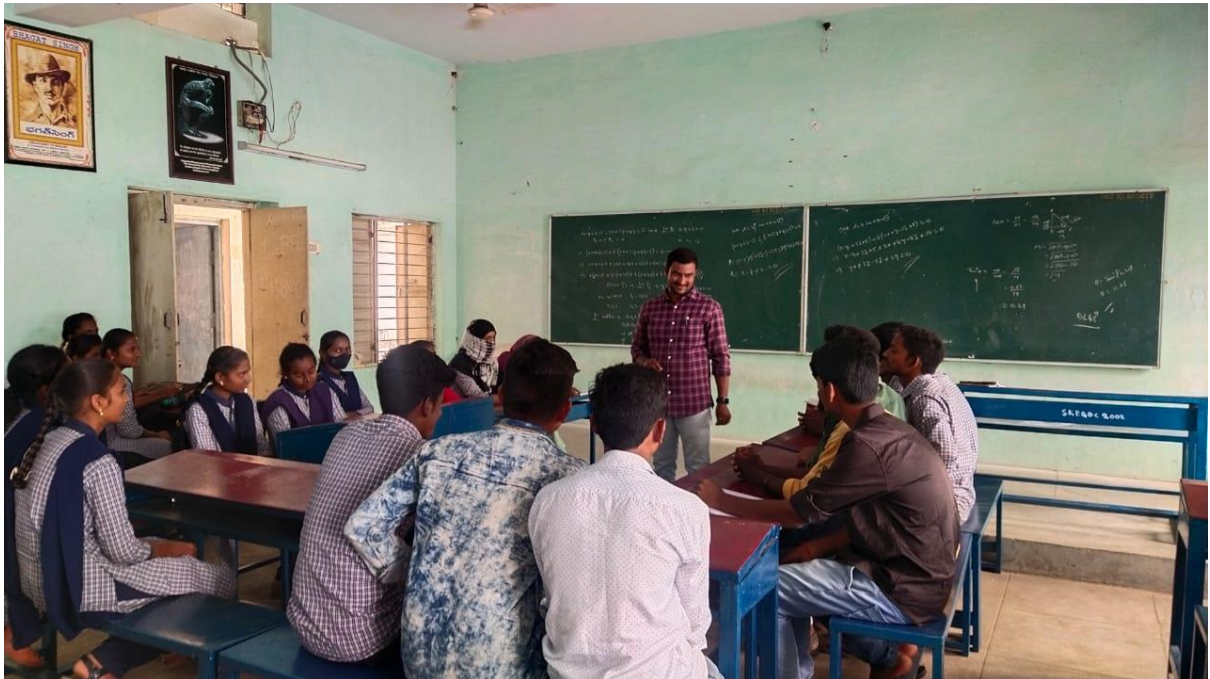
2019-2020, I BCOM STUDENTS