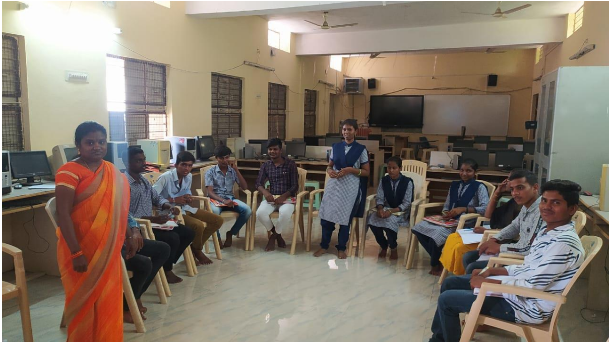
2018-2019 IBA Students